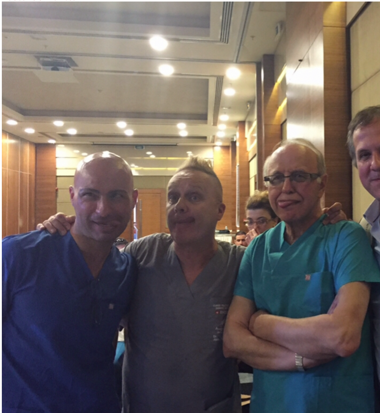
the 3 authors in full face